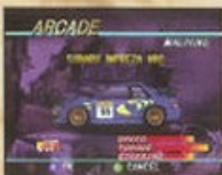
Subaru Impreza WRC