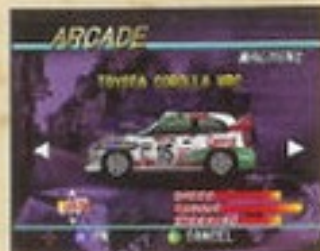
Toyota Corolla WRC