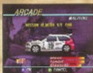
Nissan Almera Kit Car