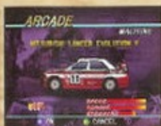
Mitsubishi Lancer Evolution V

You can choose from nine very impressive machines: