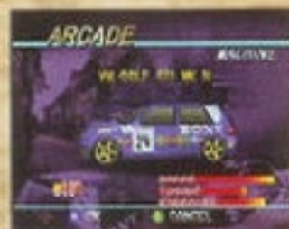
Volkswagen Golf GTI MK IV