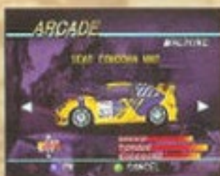
Seat Cordoba WRC