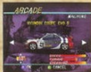
Hyundai Coupe Evo II